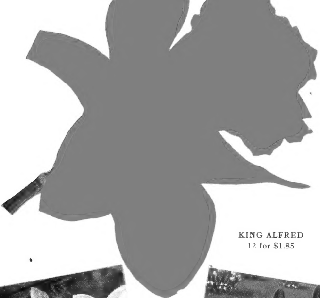
KING ALFRED 12 for $1.85